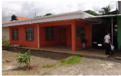
Another view of the parsonage. Hope you like the color! It is shouting at you! But the parsonage is very nice and with a large living area and kitchen that is suitable even for meetings.