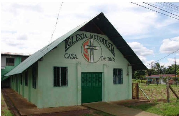
This is the church and the new lot to the left is what was recently purchased for the enlarging of the sanctuary.