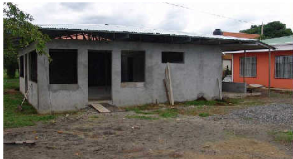
The soda has more done now but I don't have a better picture.