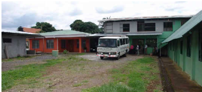
Pital parsonage taken last July. The educational building is behind our bus, church to the right and soda on the left.